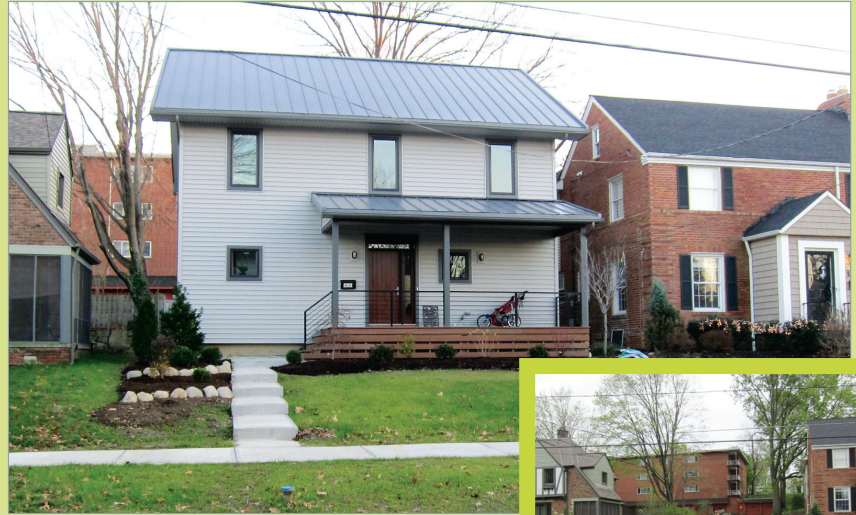
A generous front porch helps disguise the home’s basic square footprint. The home’s tight and fill lot created some construction challenges.

Insulation and airtightness. The Strauss home has 4 inches of below-slab insulation (R-20), foundation insulation (R-22 continuous, plus R-13 cavity), 3½ inches of exterior foam (R-21 continuous, plus R-15 cavity), energy-efficient windows